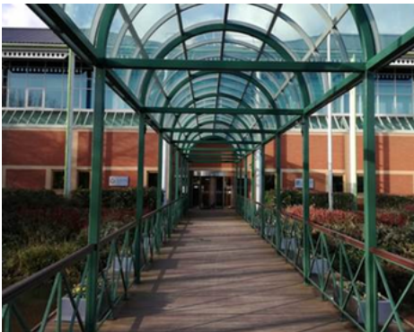
View standing on bridge