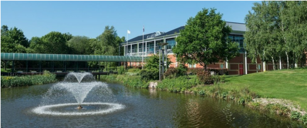
Bridge at entrance to venue